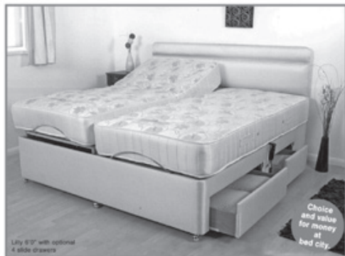
Lily 6'2" with optional 4 slide drawers

Come and see our selection of quality electrically adjustable beds in our showroom today