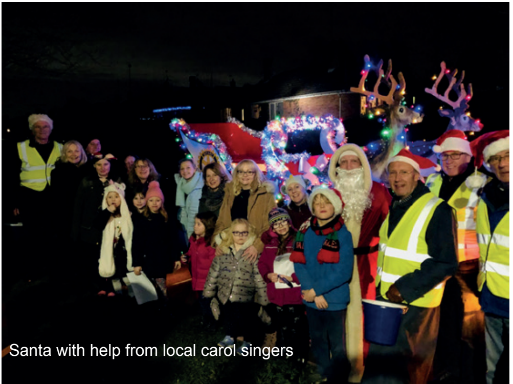
Santa with help from local carol singers

A big thank from Santa, Clent Hills Rotary and Hagley Scouts for your most generous donations to this years Rotary Christmas sleigh collection.