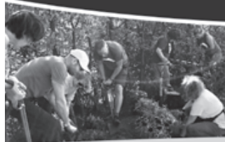
SERVING IN THE COMMUNITY RENOVATING JUBILEE GARDENS

PART OF THE LIFE AND COMMUNITY OF HAGLEY