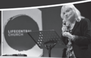
SUNDAY SERVICES AT HAYBRIDGE HIGH SCHOOL & SIXTH FORM