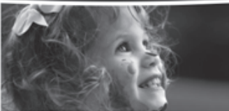
LITTLE TREASURES TODDLER GROUP HAGLEY COMMUNITY CENTRE THURSDAYS 10AM-11.30AM