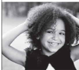
Little Treasures Toddler Group Hagley Community Centre Thursday 10am - 11:30am