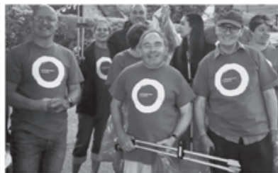
Serving in the community Monthly Litter Pick

We are loving being a part of Hagley life and community. Thank you for making us so welcome!