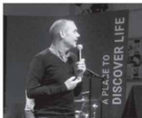
Services @ Haybridge High School and Sixth Form