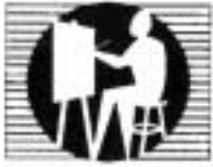
HAGLEY ART CLUB